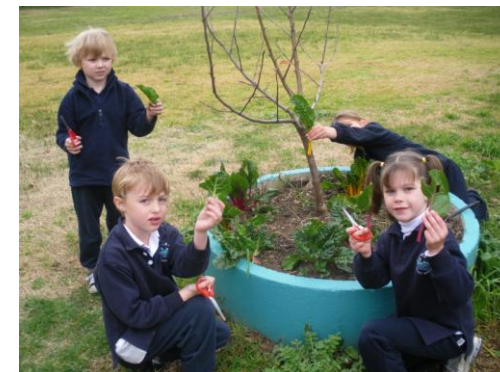
Photos of the children picking and preparing the vegetables out of the school garden for tuckshop.